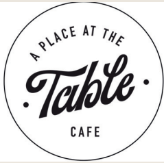
A PLACE AT THE TABLE Page 1