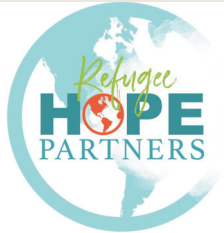
REFUGEE HOPE Page 8