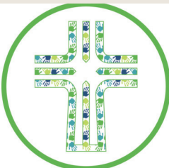
SAPC PRESCHOOL Page 10